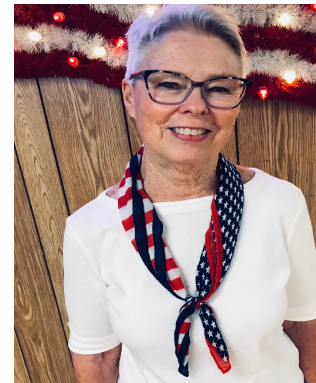
Dear Brothers and Sisters

Time is marching on and spring is in the air. I'm sure everyone is happy to have most of the winter in the rear- view mirror.